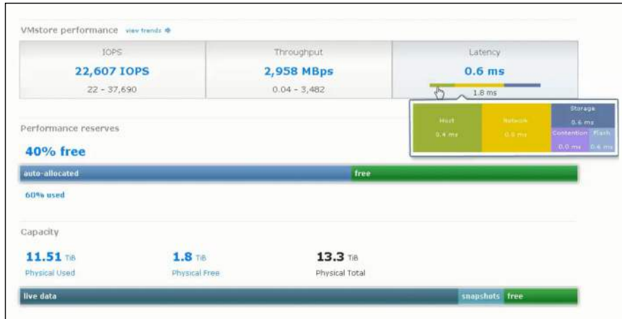
Figure 2 – Tintri end-to-end visibility across host, network and storage